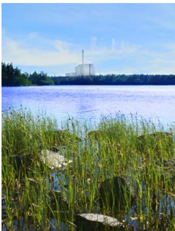
Forsmark nuclear power plant

Vattenfall AB has majority ownership in seven reactors in Sweden, three boiling water reactors (BWR) at Forsmark (together 3274 MW and app. 24,6 TWh/year) and one BWR and three pressurized water reactors (PWR) at Ringhals (together 3717 MW and 24,4 Twh/year). They are base load plants.